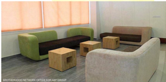
BROTHERHOOD NETWORK OFFICE FOR ABP GROUP

My favourite project is the first one in India, back in 1998. I was commissioned by Pal-Peugeot to do their new regional office of 1,000 sq. ft. area in Kolkata. The client gave me a free-hand with the design, but with a tight budget. This office was featured in three of India's leading design magazines and got me started on building Designers Guild.